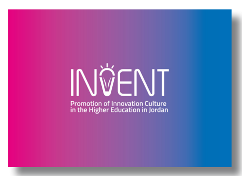
Figure 6. Powerpoint template