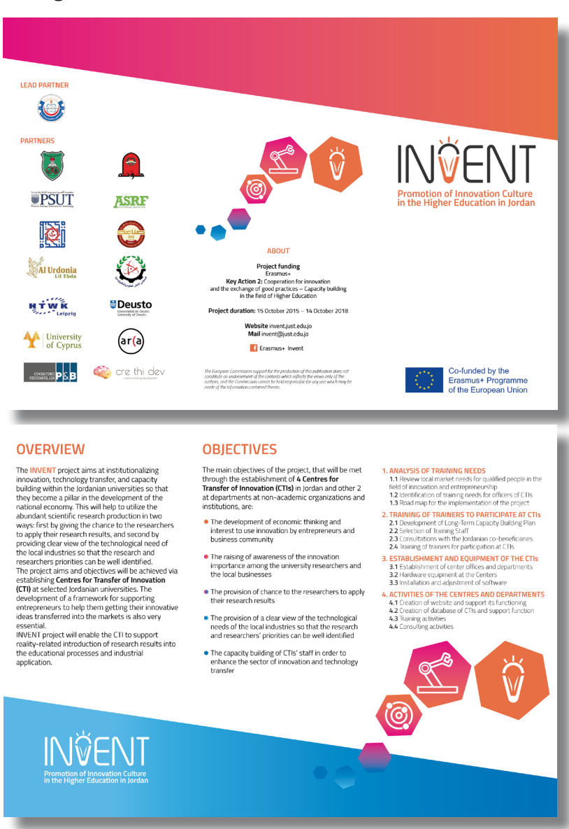
Figure 2. INVENT brochure

Flyer at 3 doors, A4 format open, printing in colour front and back Patinated matt paper 160 gr