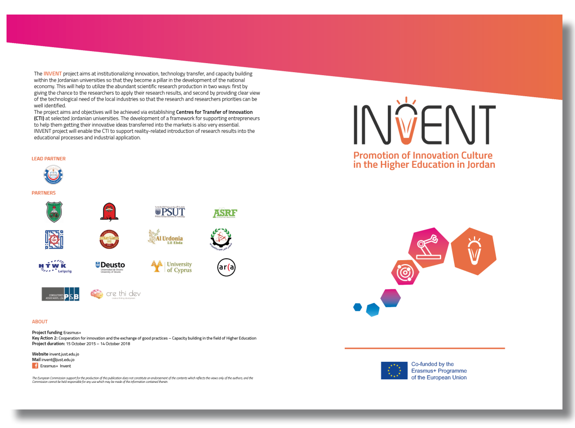
Figure 3. INVENT folder

1 pocket, printed full color outside only Patinated matt paper 300 gr