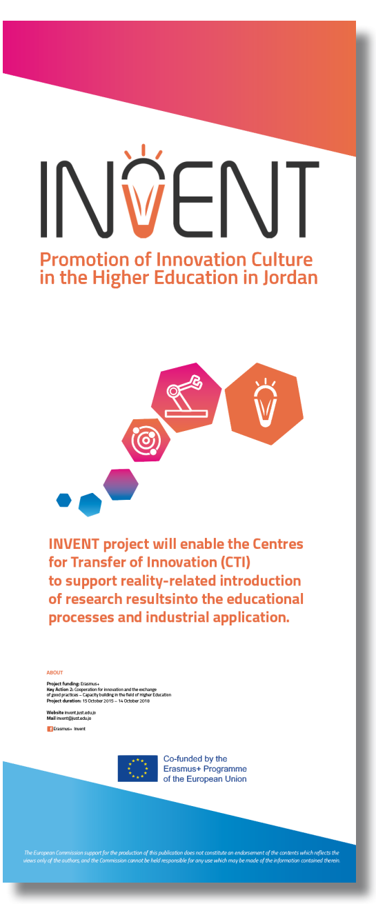
Figure 5. INVENT rollup

Steel structure. Ppl printing, laminating